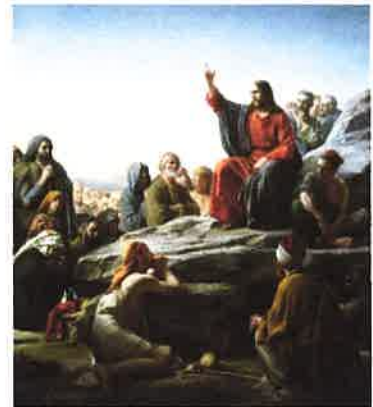
Christ's Sermon on the Mount by Carl Bloch